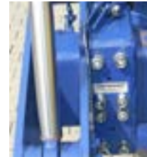
2 Measuring element FLW-1