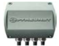
3 Inclination measuring system