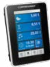
1 Weighing electronics